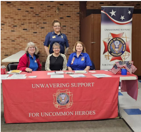
Auxiliary Members of VFW Post 8724 in Duncansville helped with a successful Veterans Health Fair.