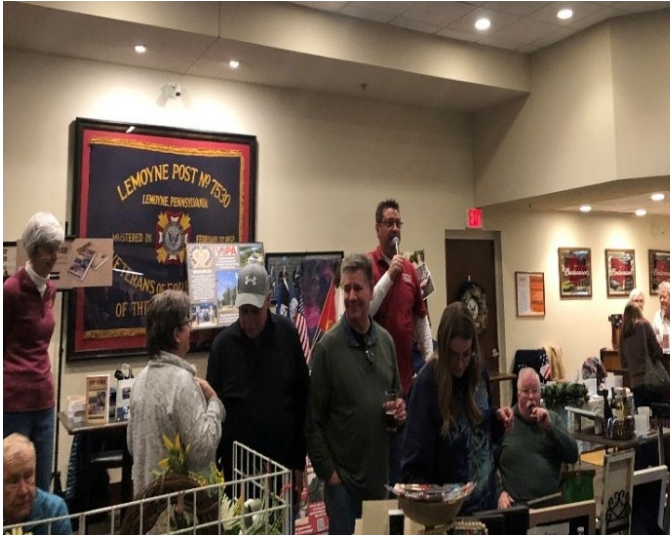
Auxiliary to Post 7530, Lower Allen, held an Artisan Fair to raise money slated to be donated to Veterans Outreach of PA, assisting homeless veterans.